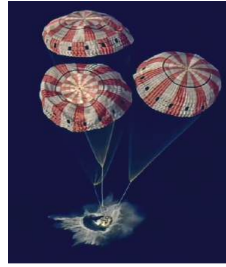
or 24,661 mph (39,668 kph) — just shy of the record before slowing to a 19 mph (30 kph) splashdown. "A perfect bull's-eye splashdown," reported Mission Control's Rob Navias. Artemis II's record flyby and views of the moon

The last time NASA and the Defense Department teamed up for a lunar crew's reentry was Apollo 17 in 1972. Artemis II was projected to come screaming back at 36,170 feet (11,025 meters) per second —